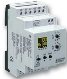
Insulation monitor RN 5897