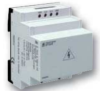
Coupling device RP 5898